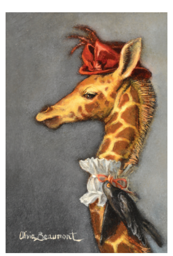
Miliner's Daughter, oil on canvas, 5" x 7"

Gallery 11 – City Market Savannah, Georgia www.savannahcitymarket.com/art/listing