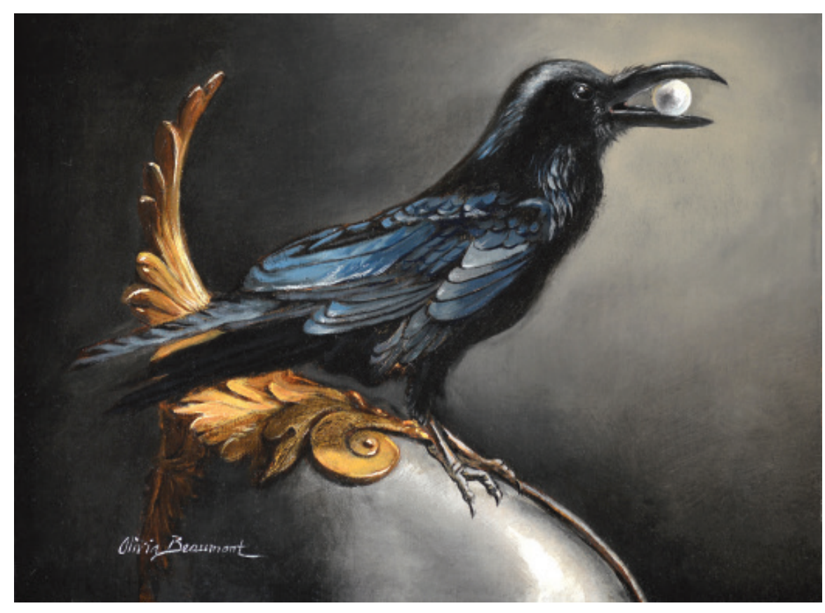
previous page, Conspiration of the Beasts, oil on canvas, 40" x 58" above. Poet's Pet. oil on canvas. 8" x 10"