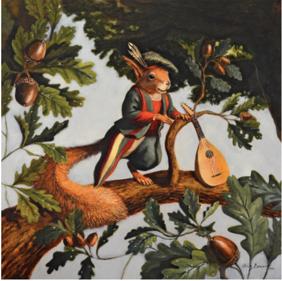
Minstrel, oil on canvas, 24" x 24"