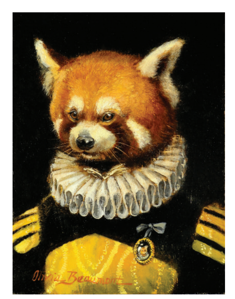
left, Donatella, oil on canvas, 5" x 7" above, Titia Van Ulyenburg, oil on canvas, 5" x 7"