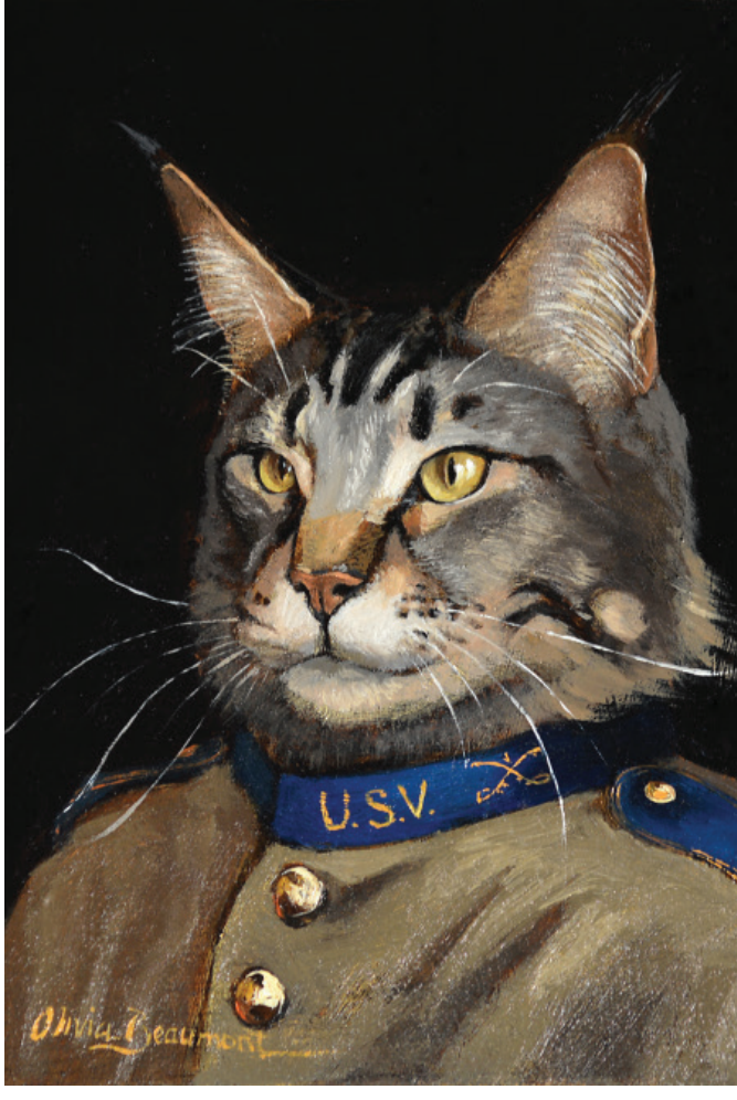
Rutherford, oil on canvas, 5" x 7"