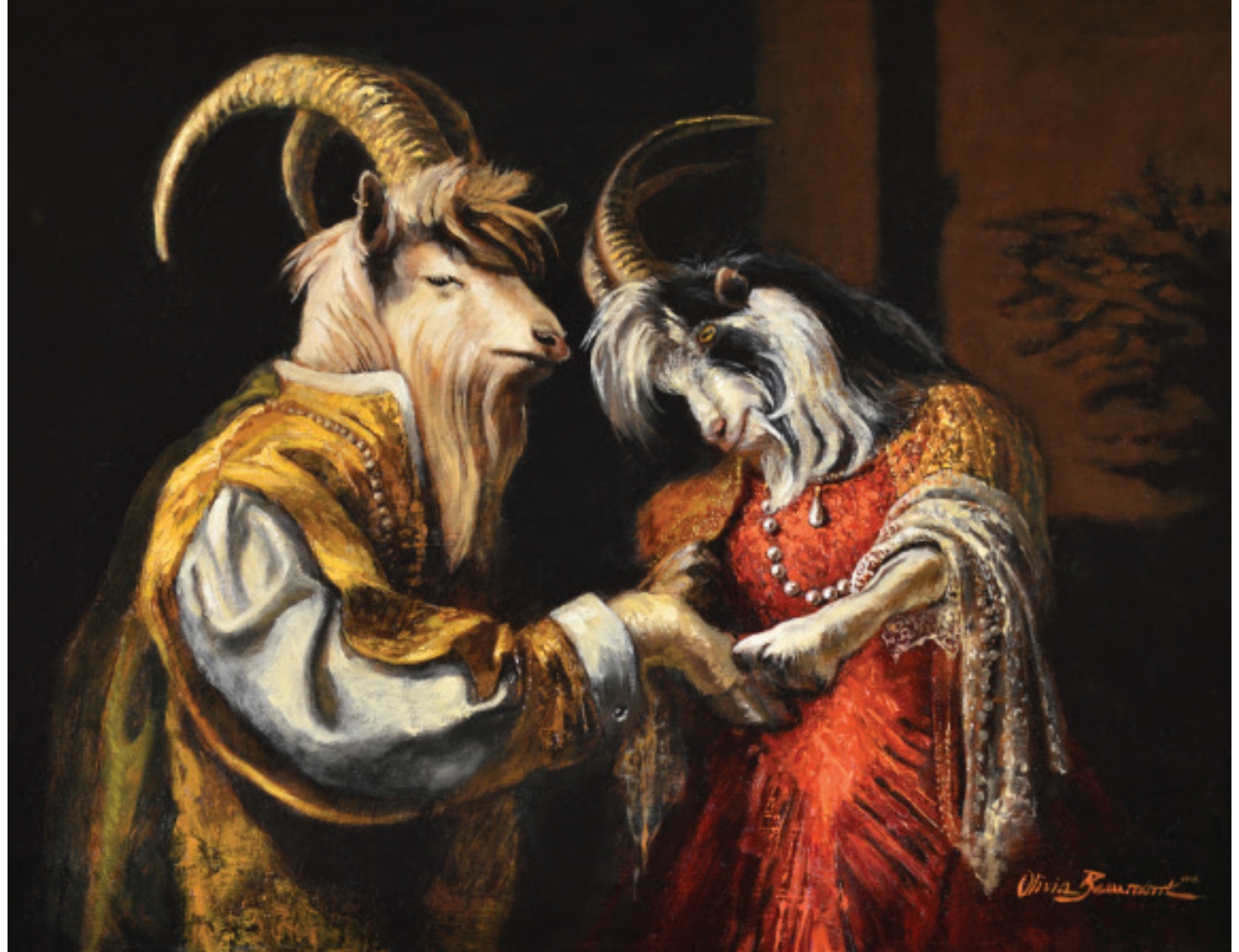
left, Cerise the Great, oil on canvas, 20" x 24"