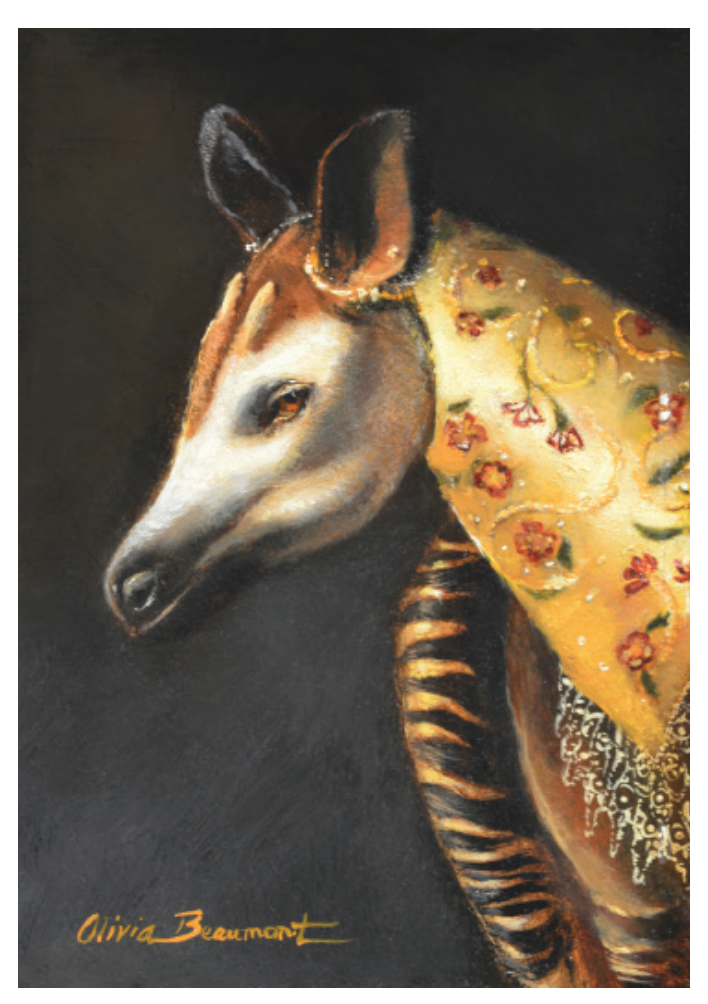
above, Model of Propriety, oil on canvas, 5" x 7" right, A Grand Image, oil on canvas, 5" x 7"

is animated to both the artist and the viewer.